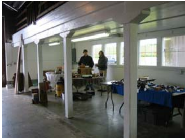
Selling tools in the barn at Greenbank Farm!